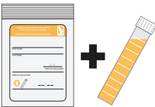
Plastic bag containing: 1 urine tube and 1 absorbent pad