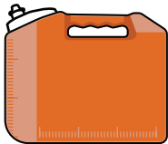
OPTIONAL 24-hour urine collection container (separate from kit contents)